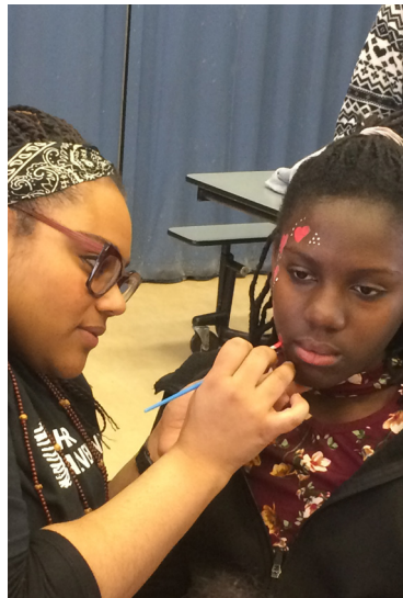
Volunteers offered face painting to the kids at Higher Achievement Baltimore.