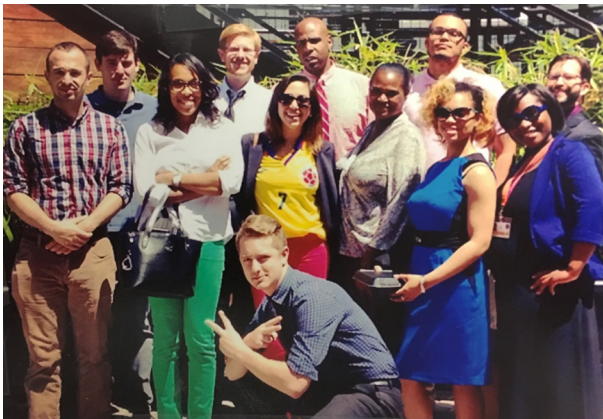
The Class of 2014