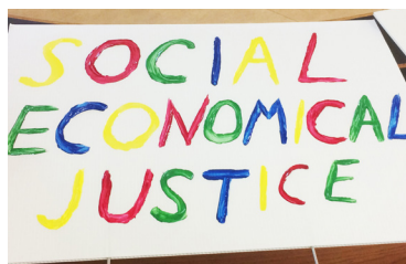
Some painted posters by volunteers for the parade.